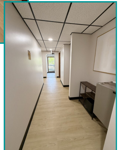
Common Area Restrooms