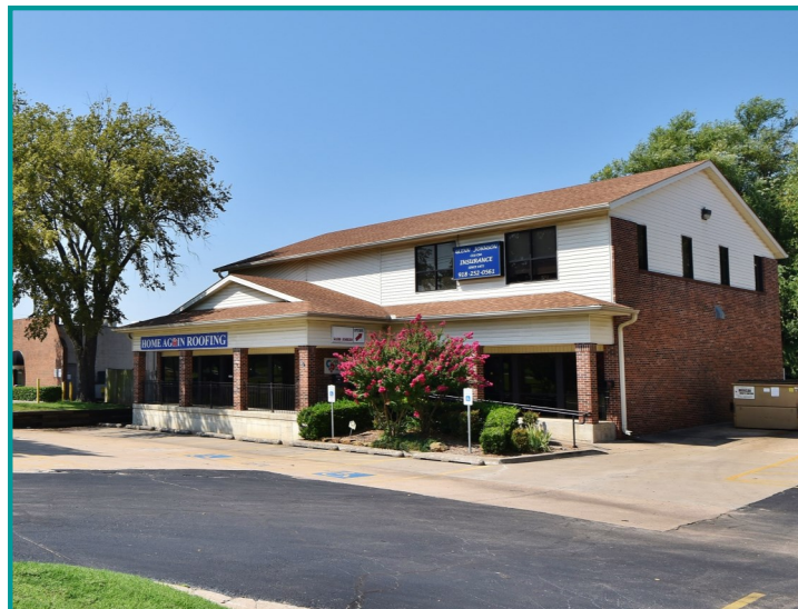
Suite 8030 C-2 Exterior View